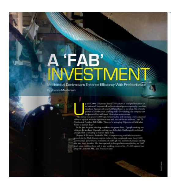
To view the whole article visit: http://www.tpmechanical.com/news/tp-mechanical-highlighted-construction-executive

In the past five years, the shop workforce has grown from 12 people working one shift per day to about 40 people working two shifts daily. Riddle's goal is to funnel enough work to the shop to warrant three shifts.